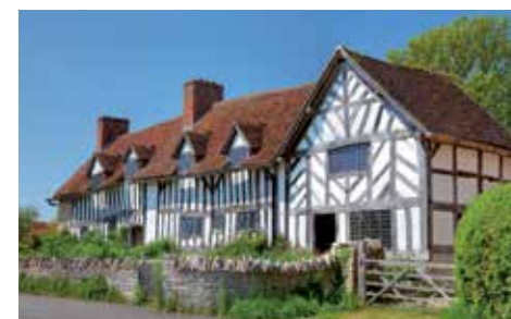
4. Stratford Upon Avon